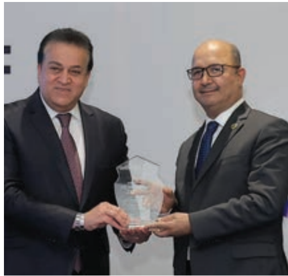
HE. AHMAD ABUL GHEIT GENERAL SECRETARY LEAGUE OF ARAB STATES

DISTINGUISHED AWARD FOR SUPPORTING HEALTH