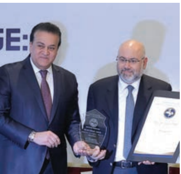
HE.DR FIRASS ABIAD MINISTER OF PUBLIC HEALTH LEBANON

ARAB DISTINGUISHED AWARD IN CRISIS MANAGEMENT