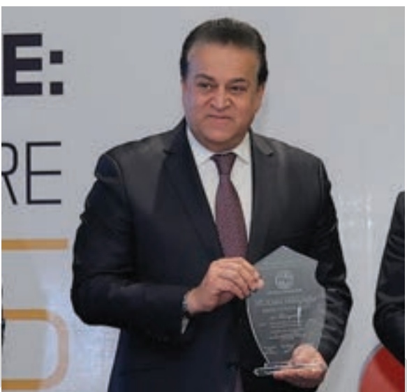
HE.DR KHALED ABDEL GHAFFAR MINISTER OF HEALTH EGYPT

DISTINGUISHED AWARD FOR HEALTHCARE IMPROVEMENT