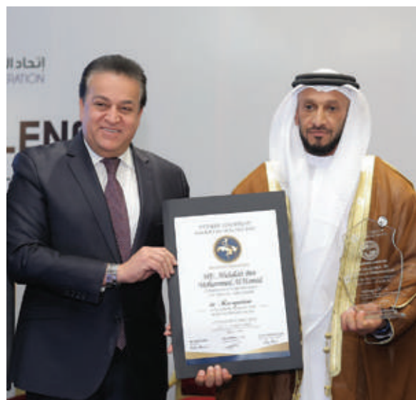
HE. ABDULLAH BIN MOHAMMED AL HAMED CHAIRMAN OF DEPARTMENT OF HEALTH – ABU DHABI