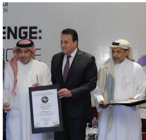
HAMAD MEDICAL CORPORATION

DISTINGUISHED AWARD FOR HEALTHCARE IMPROVEMENT